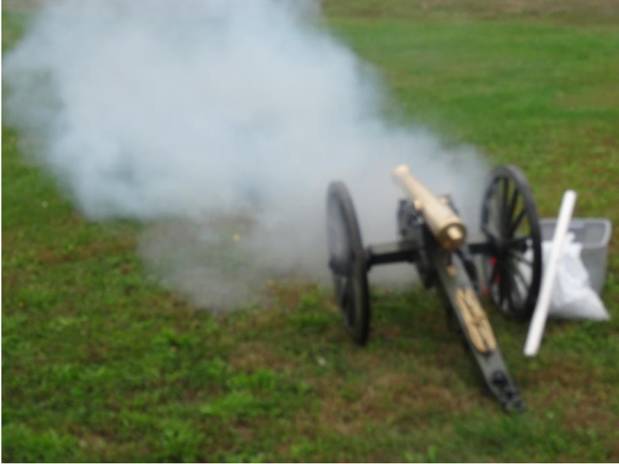
You Never Know What You Might See