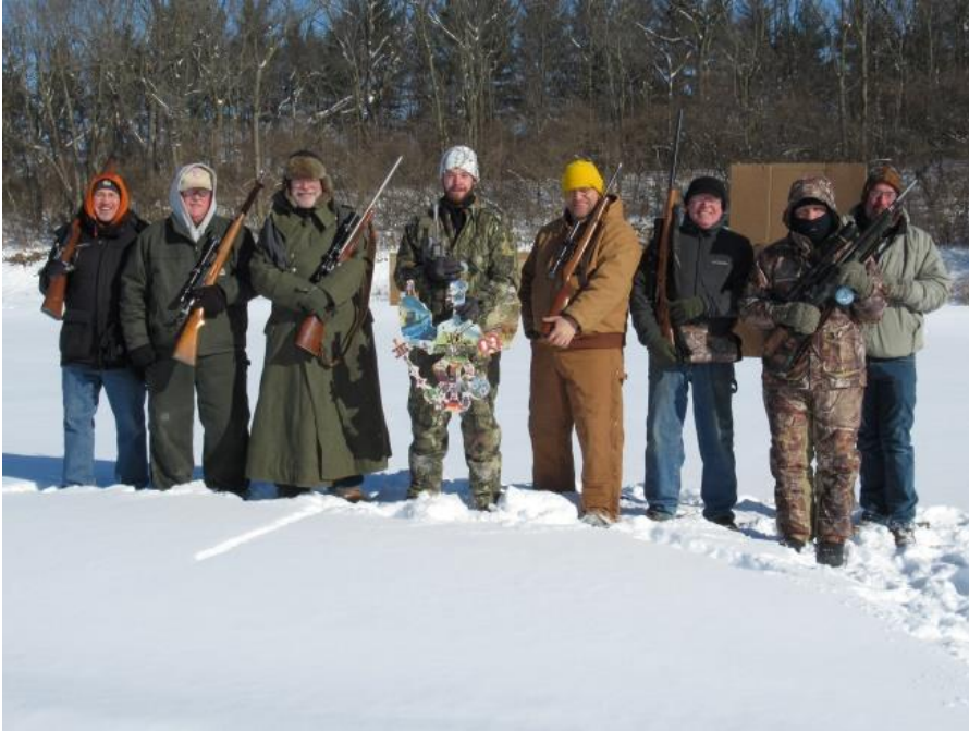
New Year's Day 2018

For the schedule and times of the Mauser Matches, please see the calendar section of the Chillicothe Sportsmen's Club monthly newsletter at chillisportsmen.org . We would welcome your participation.