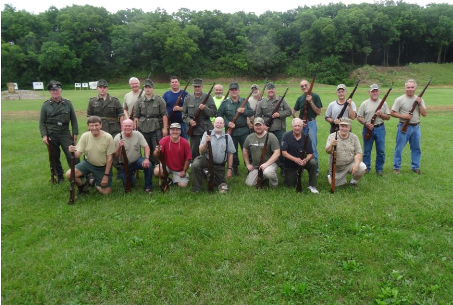
German Rifle Challenge Complete With WWII Re-Enactors