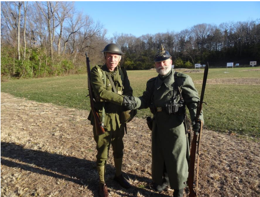
WWI Commemoration Match After 100 Years We Have Buried The Hatchet