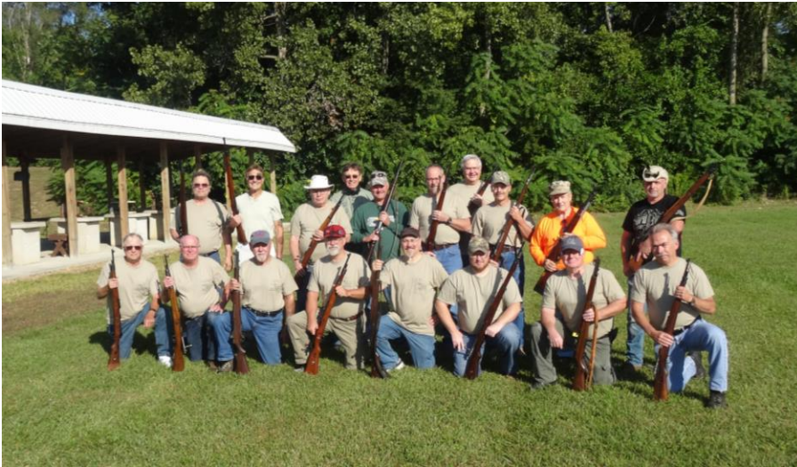
Mauser Match T-Shirts