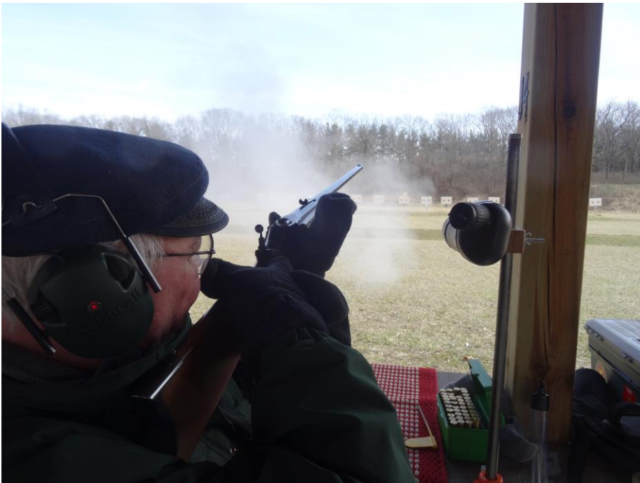
Black Powder Rounds