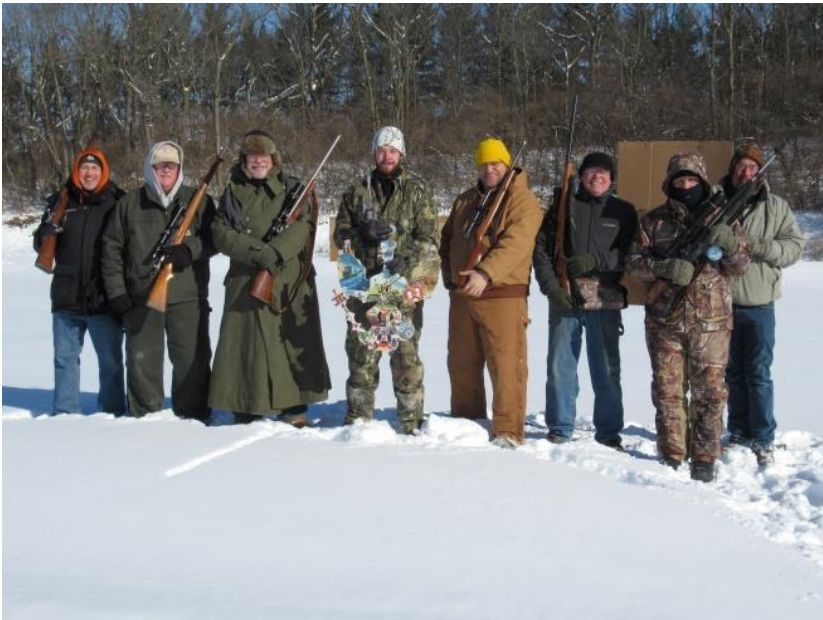
New Year's Day 2018

We shoot all year round, so be prepared for all kinds of weather.