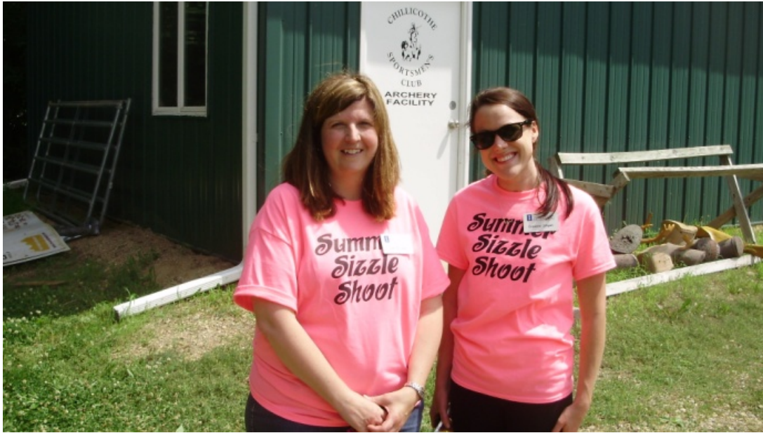
4H Regional Meet June 7