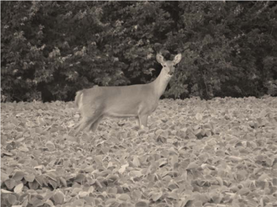
Wildlife On Our Club Grounds