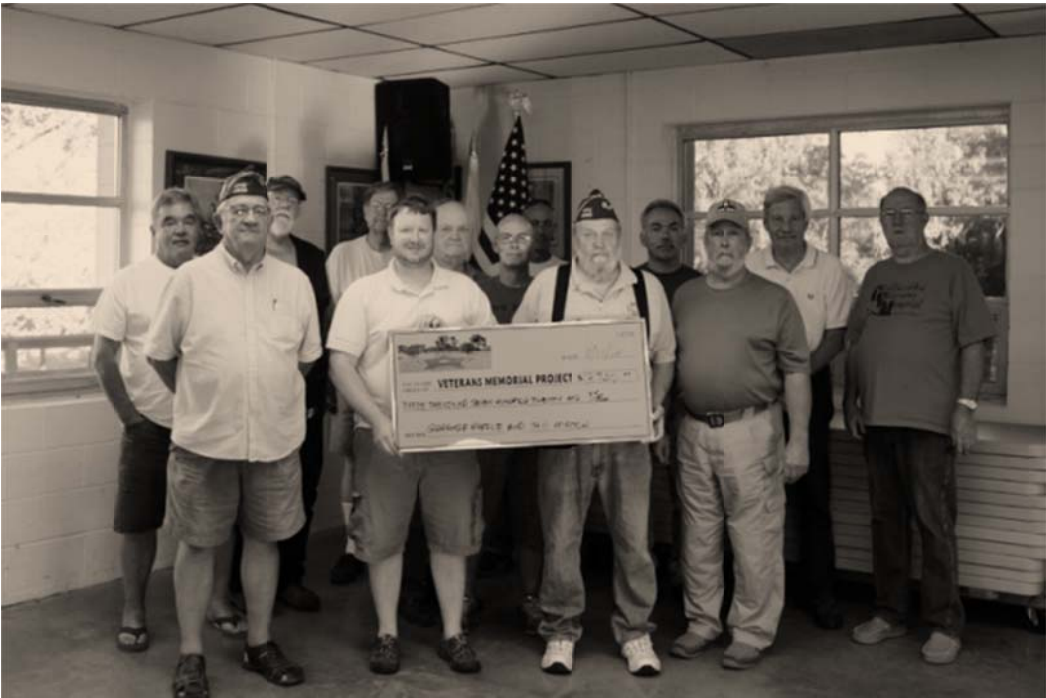
Veterans Memorial Contribution