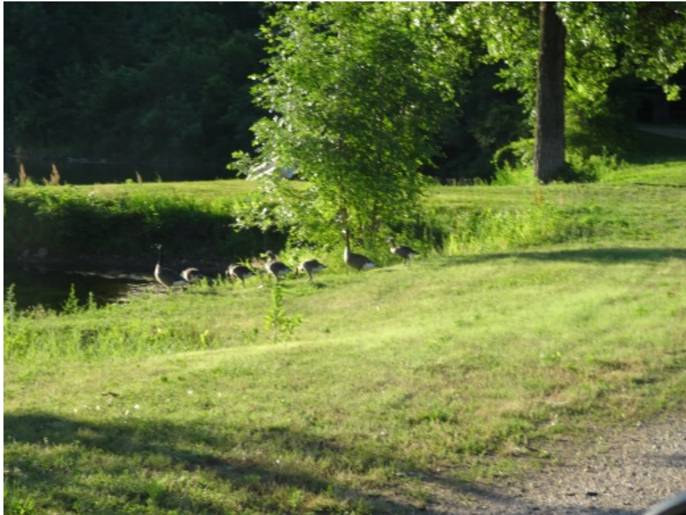
Our Resident Goose Family

When things are done we will have an even better facility.