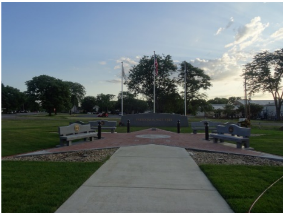
The Chillicothe Veterans Memorial We Had An Interest In This