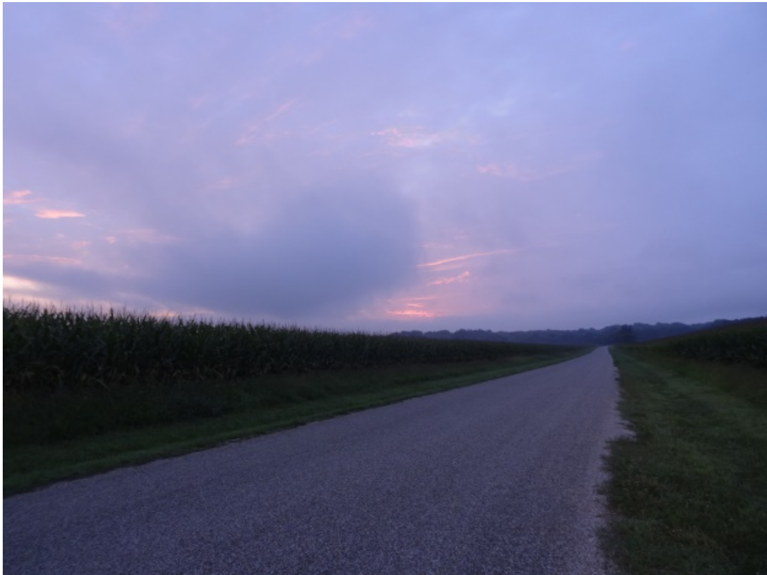
A Beautiful Sunrise At The Club